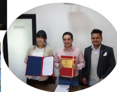
↑ Signing Ceremony for the founding