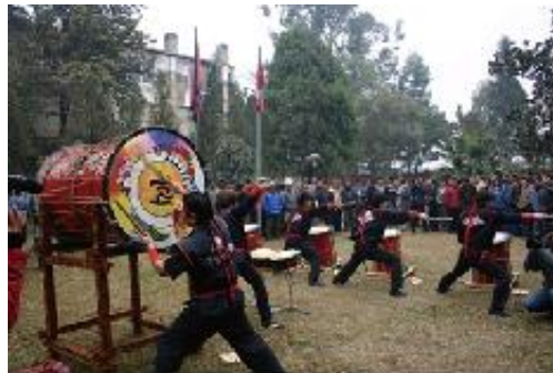
Played at the City hall of Kathmandu.