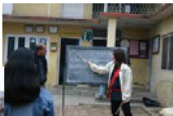
Instructed how to play the Japanese drum at IKEDA International School Kathmandu.