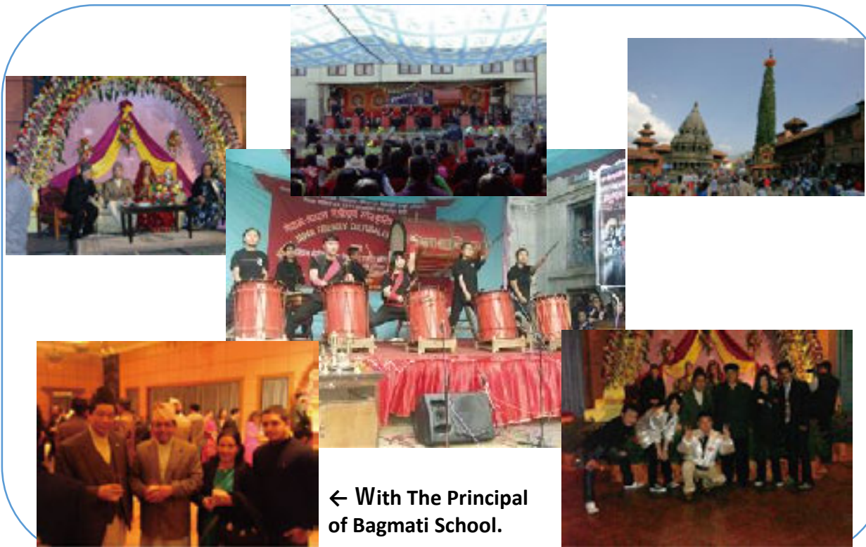
← With The Principal of Bagmati School.