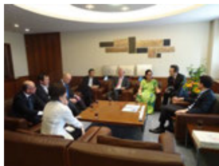
↑ Meeting With the Principal. ↓ Dinner meeting.