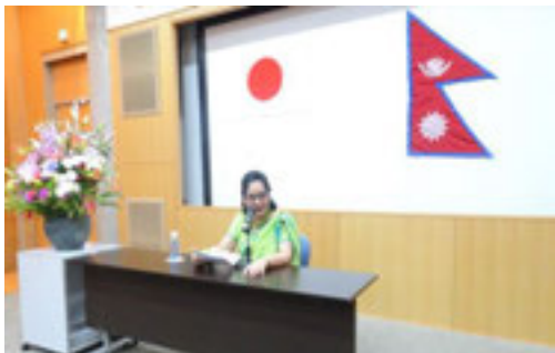
↑ Ambassador gave a lecture at Yamanashi Gakuin Univ.