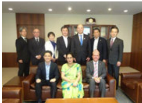
↑ With the Principal of Yamanashi Gakuin Univ.