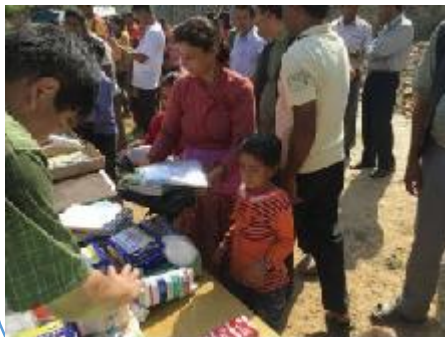
Providing relief supplies at Bal Chetan School Kathmandu