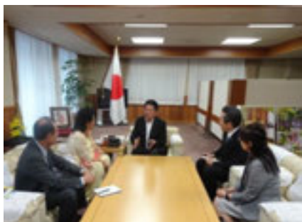
← Exchanged ideas with Mr. Governor Nagasaki about international relationships.