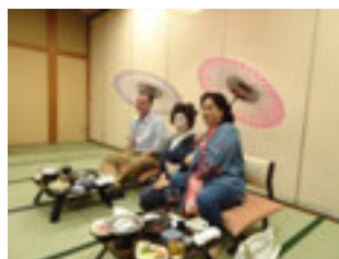
← Appreciated classical Japanese dance.