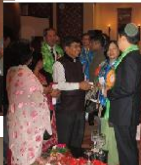
↑ Former prime minister of Nepal.