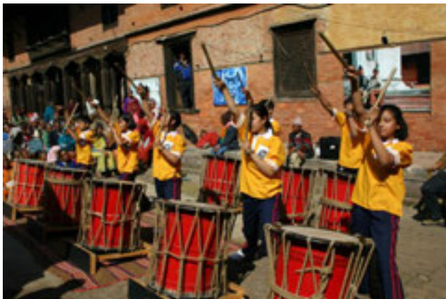
Performed at a nursing home.