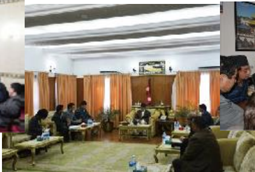
↑ Conference with H.E. Mr. Koirala Prime Minister of Nepal.