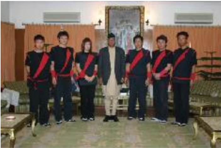
With H.E. Mr. Sher Bahadur Deuba, Prime Minister of Nepal(at that time) at Official Residence of the Prime minister.