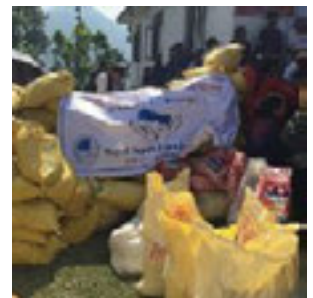
Provision of foods to 171 households