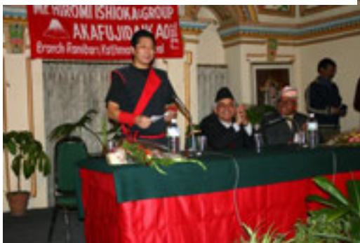
With Deputy Prime Minister and Members of Parliament(at that time).