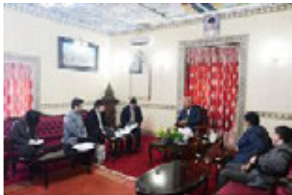
↑ Conference with H.E. Mr. Yadav President of Nepal at The Executive Office of the President.