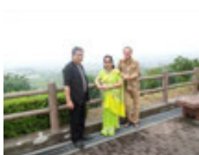
← At Scenic hill "Budou no Oka" in Katsunuma region of Koshuu city.