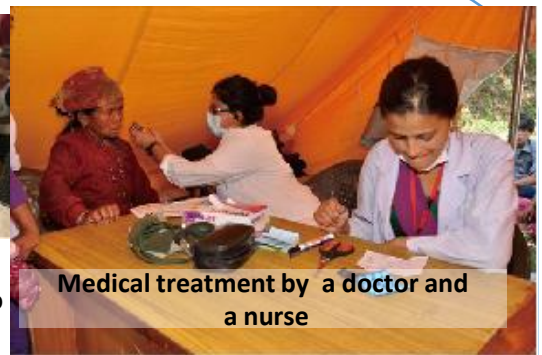
Medical treatment by a doctor and a nurse