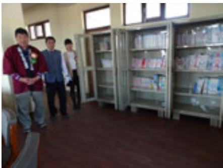
↑ Many Japanese books were donated