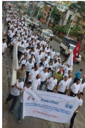
A place played for the 50 year anniversary. Parade memorial service for Earthquake.