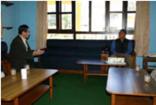
With Member of the Cabinet(at that time).