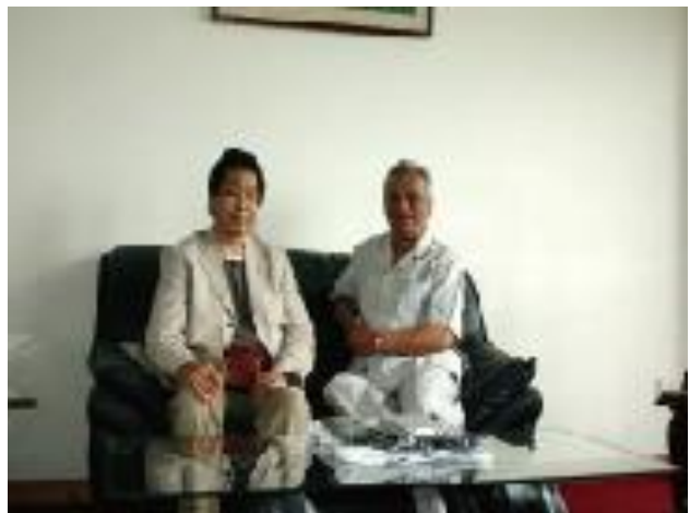
Meeting with the H.E. Mr. Chand Prime Minister of Nepal(at that time).