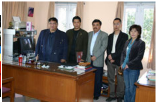
Deepened engagement with some schools.